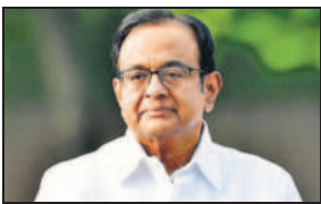
■ P Chidambaram

NEW DELHI: The Supreme Court issued notice on Friday to the Central Bureau of Investigation (CBI) on a petition filed by Congress politician P Chidambaram seeking bail in a corruption case registered against him in connection with approval given to INX Media Private Limited to receive overseas investment to the tune of ₹305 crore in 2007, when he was the finance minister. Chidambaram was arrested by the CBI on August 21, and has been in CBI custody and jail. A bench led by justice R Banumathi fixed October 15 as the next date of hearing on the petition. CBI was told to file its response on or before that date. When asked how much time the petitioner will require to argue the matter, Chidambaram's lawyer, senior counsel Kapil Sibal, said: "Not more than 15 minutes. It's a matter regard-