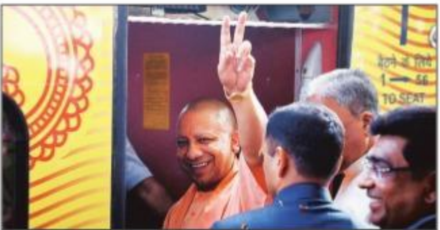
UP Chief Minister Yogi Adityanath flags off the Tejas Express in Lucknow on Friday. The commercial run of train, which will ply between New Delhi and Lucknow, starts on Saturday.

officer said. She had applied for Indian citizenship immediately after her marriage, however it was not accepted on some legal grounds. Since 1994, she had been residing in the country on long-term visa, and was granted Indian citizenship early this week, the official added. She can now apply for Aadhaar, ration card and voter ID.